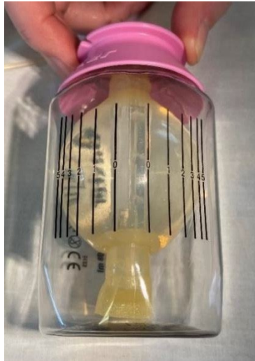
Infusion device half full