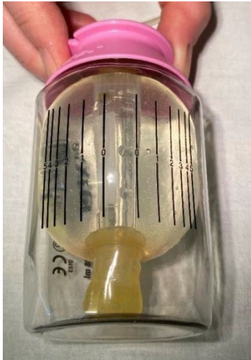
Infusion device full

The markings may be obscured by labels but you should be able to get a good indication of whether the balloon is going down or not. You should check your device every morning and evening to see that it is shrinking.