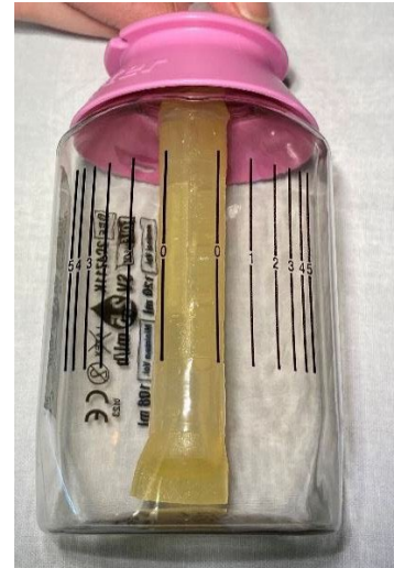
Infusion device empty (balloon may appear stretched)