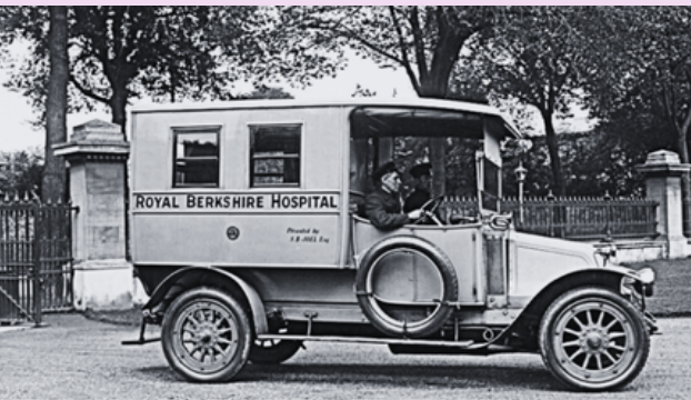
Medical Museum Staff Open Day Monday 15 July 10.30am to 4pm

Join us on Monday 15 July 2024, between 10.30am to 4pm