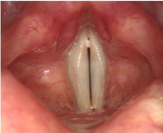
A healthy larynx

Damage to the larynx from stomach refluxate will affect a person's voice and can sometimes affect their lungs and breathing.