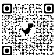
Macmillan Cancer Support